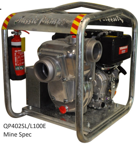
QP402SL/L100E Mine Spec